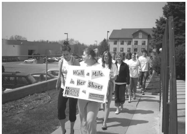
Walk a Mile in Her Shoes was one event coordinated by U-SaFety for Sexual Violence Awareness Month in April, 2008.

The U-Safety Program has taken off with substantial gains over the past seven months. Getting the word out about the program throughout campus takes time. Both students and personnel are interested and excited to learn more about the topics.